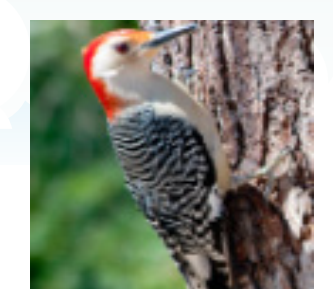
Red-bellied Woodpecker Large, black and white bars on back/ wings, red stripe on head/ neck(male) neck (female), reddish belly.

Large swallow with pointed wings and forked tail. Male is glossy blue-black all over, female gray below, with white belly. Colony nesters that eat flying insects.